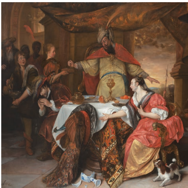
Jan Steen, The Wrath of Ahasuerus, c.1665-70